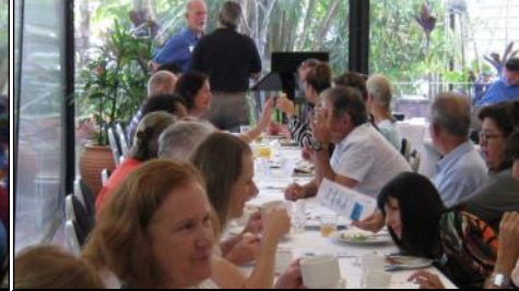
...and everyone's happy!