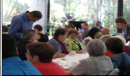
...and more networking...